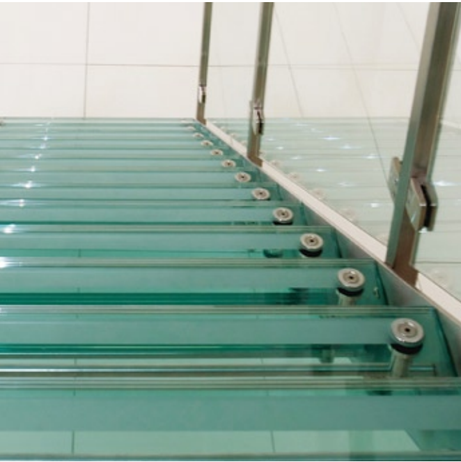
ABOVE The open plan dining and living area is a perfect space for the family to spend time together. LEFT The stunning glass staircase is in keeping with the contemporary style of the house. RIGHT The plentiful storage space in the white high-gloss kitchen helps to maintain the clutter-free environment that the Hugget family enjoy.